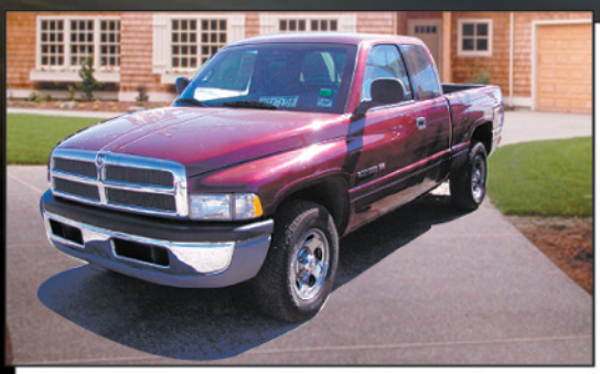
2001 Dodge Ram

2007 MAZDA REWRITING THE BOOK • PARTS HOT USED CARS FEATURED