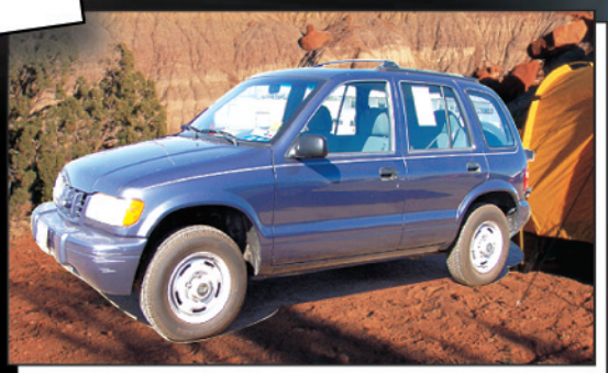
2001 Kia Sportage